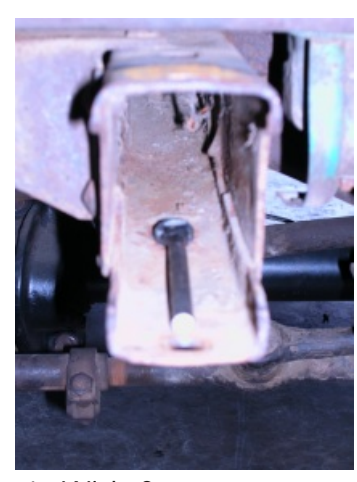
1. With frame exposed, place the nut over the back hole.

This instruction sheet covers the basic install of our front bumper and brackets to the Early Bronco. It starts with the stock bumper removed and the end of the frame exposed. Once the brackets have been secured to the frame, the bumper mounts directly to the brackets using the supplied carriage bolts. It is recommended to have at least 2 people to support the bumper during installation.